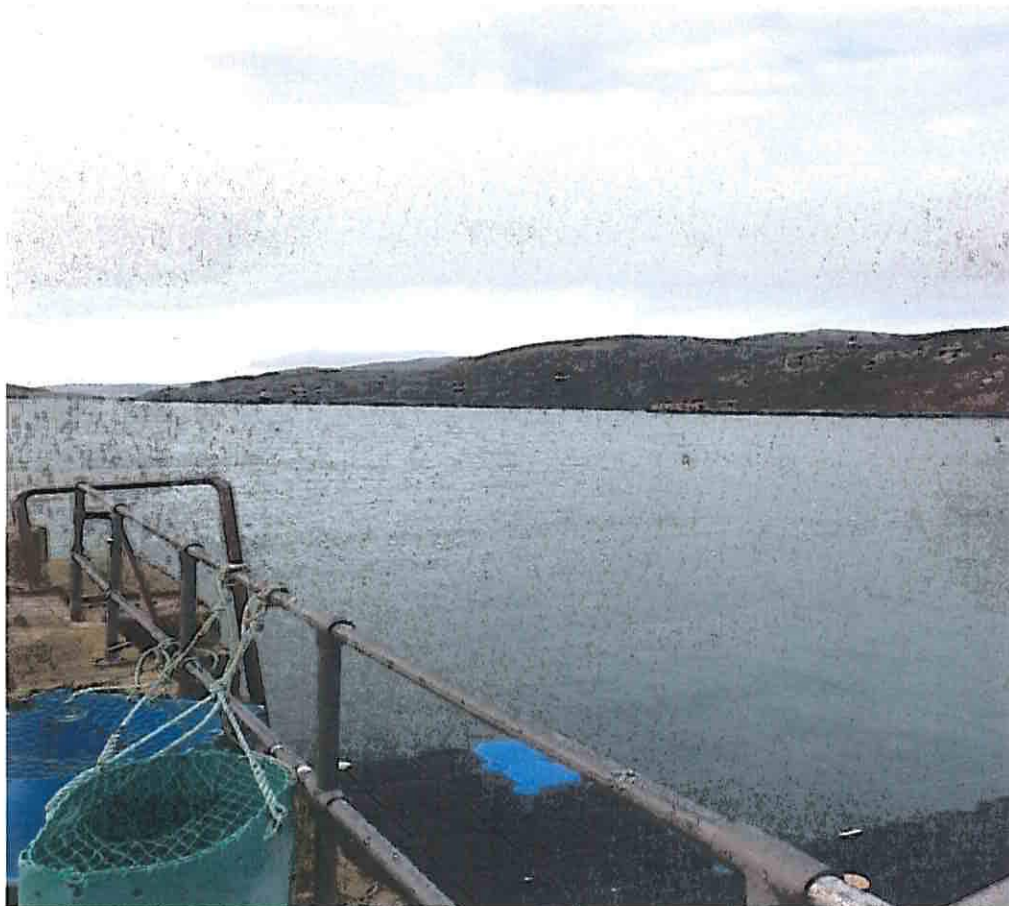
Photograph; showing view to west of pier in Crookhaven note the number of moorings and the lack of any moored boats.