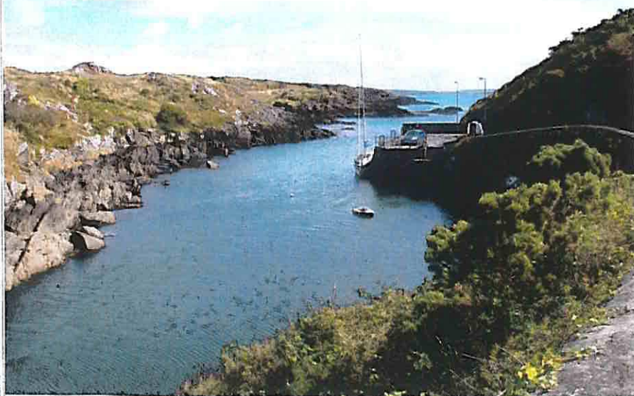
Goleen, looking seaward

distance off, though the cleft does not become apparent till very close. The high sides provide excellent shelter from offshore breezes but the inlet is open to the SE. There are no dangers in the approach but in the entrance itself there are rocks awash at HW on the N side, so keep over to port. The quay marked on the chart is the old one; the newer quay, 30m long, on the S side, is closer to the mouth of the creek, and has about 1m at LAT. A yacht should not be left unattended in case the berth is required by a fishing vessel. Turning room is very restricted, with only 40m between the quay face and the cliff opposite. There is no room to anchor and the inner part of the inlet dries. Shop, PO, pubs, restaurant, filling station at Goleen.