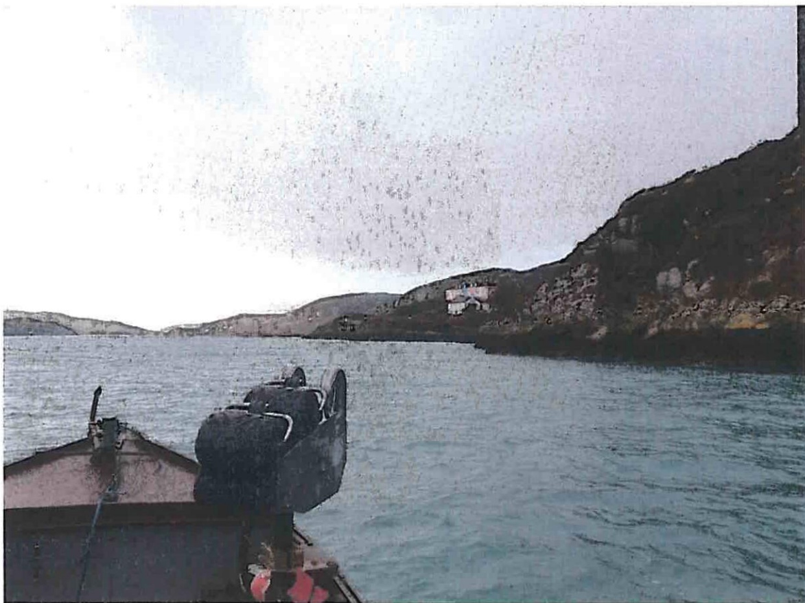
Photographs; Showing Site 432 B looking west running along the cliff line.