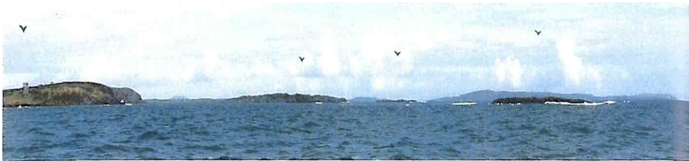
Barrel Sound from the WNW; Leamcon Castle (L), Dromadda in line with the Goat Islands (centre L), Illaunricmonia (centre R) and Duharrig (R). Cape Clear Island in the distance