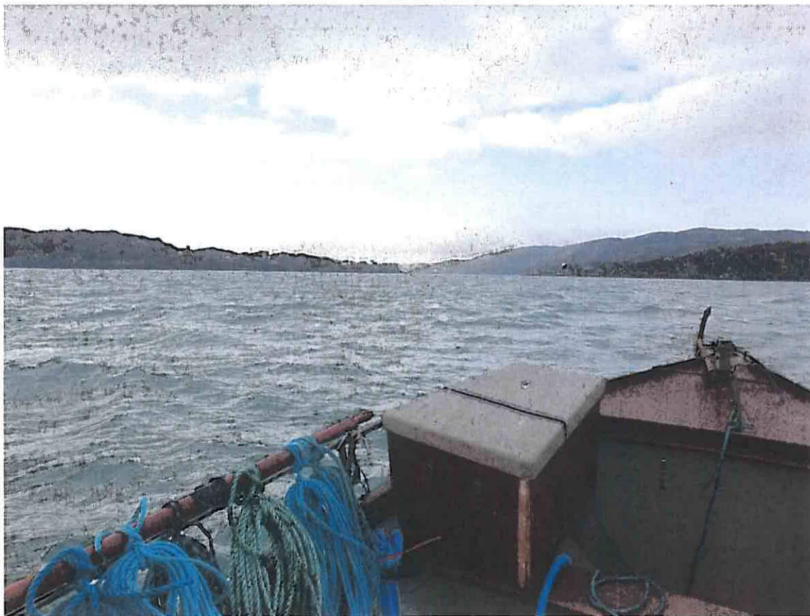
Photograph; Showing view from the sea looking west from navigation way point off Sheemon Point for entry into Crookhaven. Site 432 B is against the cliffs away on the right of this picture.