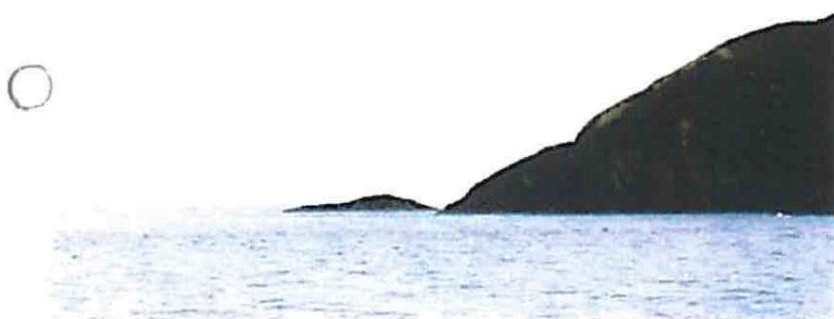
Alderman Sound: Gokane just open of Streak Head. View from the NE

There is only a slight tidal stream in the harbour. The tide sets strongly through Alderman Sound and care should be taken not to be drawn into it in calm weather. Constant -0045 Cobh; MHWS 3.3m, MHWN 2.7m, MLWN 0.9m, MLWS 0.3m.