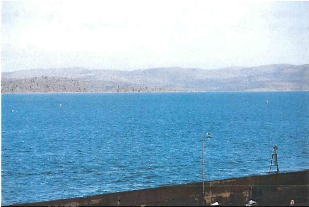
Photograph; Showing the minimal visual impact of a seaweed farm from 300 meter away. Note the SMB's, 14 long lines are present. Structure is of buoys and sinking rope.