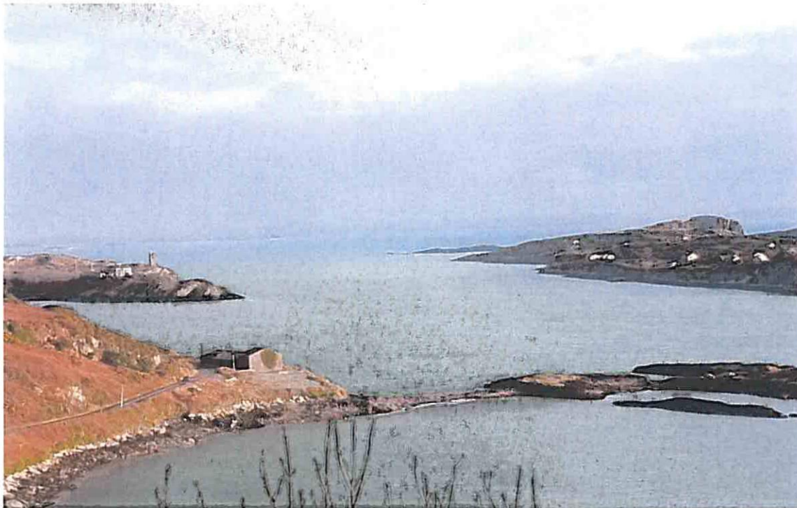
Photograph; Showing elevated panorama of entrance to Crookhaven looking east. Note the large navigation channel indicating suitability of location of site 432 B.