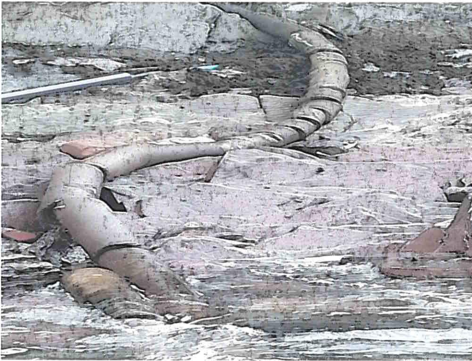
Photograph; Water Pipe Line Running From Crookhaven to Rock Island as shown on Admiralty Chart 5623.11.