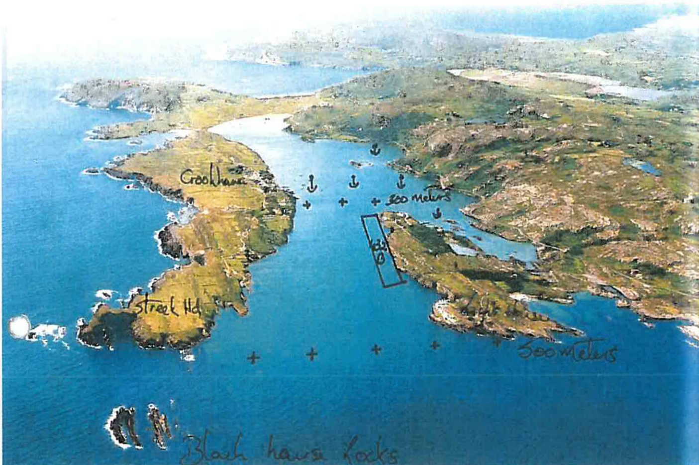
Crookhaven from the E: Alderman Rocks, Streak Head and Gokane, bottom L, Crookhaven village, L centre. Brow Head top L, with Barley Cove and Mizen Head at top