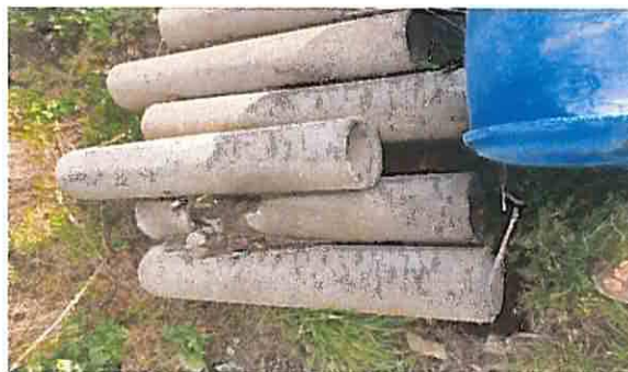
Photographs; Showing the HDPE water pipe and 6-inch concrete sleeving used to weigh pipe down. Pipe and sleeving have been in place 25 years and are buried underneath mud and silt.