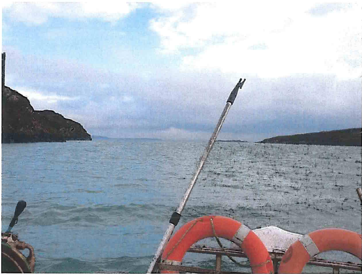
Photograph; Showing Site 432 B looking east along the cliff line.