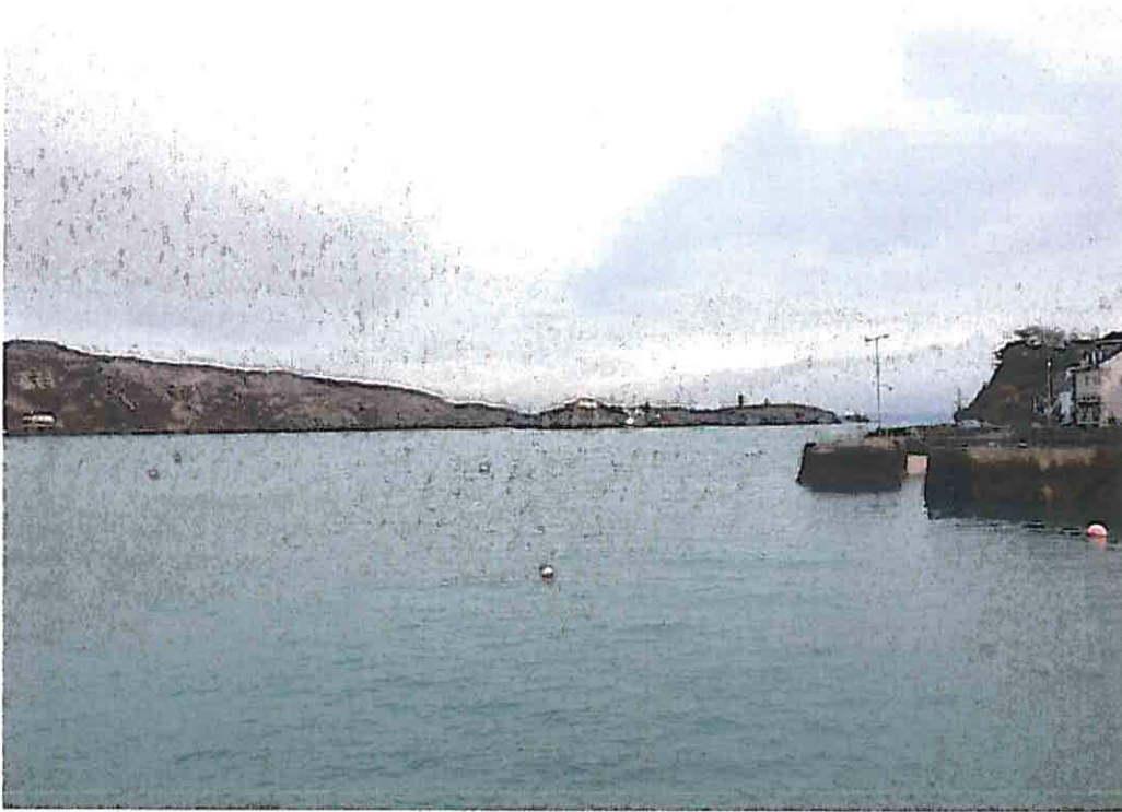
Photograph; showing view to east from pier in Crookhaven note the number of moorings.